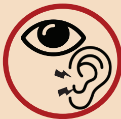
Ear or eye infection